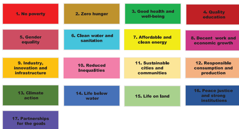
Fig. 1. An overview of the 17 United Nations Sustainable Development Goals. Modified from (65, 66).

(MDGs) (Fig. 1). This marked the start of a renewed and collective global effort to tackle the indignity of poverty, especially in low- and middle-income countries (LMICs), as well as an acknowledgment of the need for the human species to adjust its living patterns within sustainable planetary boundaries. Thus, the SDGs represented a considerable advance from the MDGs, with a substantially broader agenda affecting all nations, requiring coordinated and sustainable global actions (2). The processes toward the 17 SDGs were led by the nations rather than steered by international agencies as was the case with the MDGs. The UN Member States themselves guided the whole SDG process, including leading discussions and the selection of goals, targets, and indicators (3).