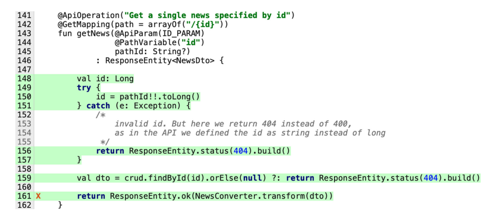
Fig. 4. An example of coverage of GET /news/{id} endpoint in rest-news achieved by our technique